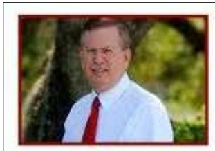
Congressman Rich Nugent (R)

The comments by Congressman Rich Nugent were very inspiring for the audience and stimulated a lot of interest in the importance of the election in November 2012 since Washington believes “that we should take every nickel earned and give it to somebody else.” Congressman Nugent said that we should not sit on our hands but that we should get out and vote.